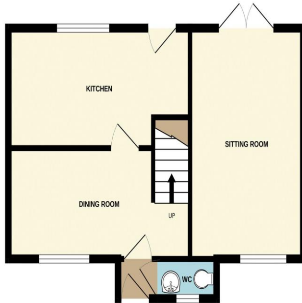
GROUND FLOOR 431 sq.ft. (40.0 sq.m.) approx.